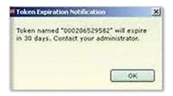
Back to top

Login remotely to keep your remote access current. Do this at least every 180 days.