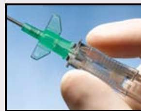
Available with winged hub.