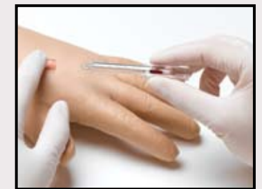
3. Unique, patented, formed-in-place gasket is designed to minimize blood exposure.