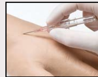
1. Electropolished V-point needle provides ultra smooth insertion.