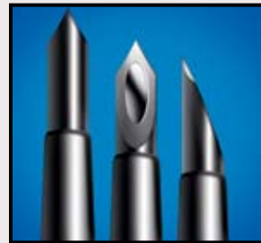
Unique V-point needle provides ultra-smooth insertions.