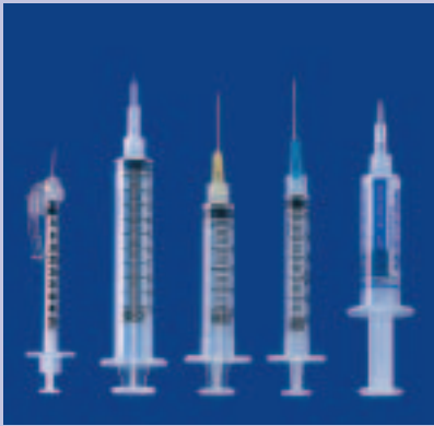
Syringes with Needles and Cannulas