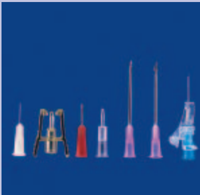
Needles and Cannulas