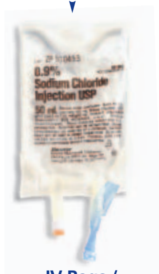
IV Bags / IV Systems