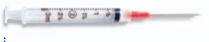
Blunt Fill Needle