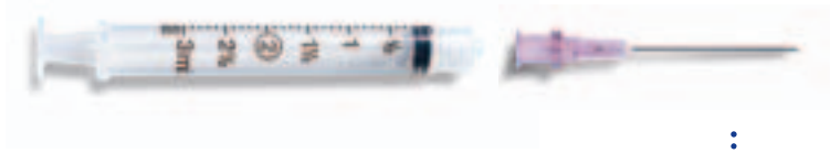
Blunt Filter Needle