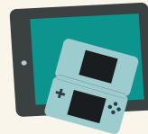
iPad or DS