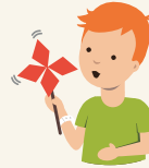
Breathing or blowing