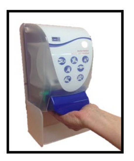
Perform hand hygiene.