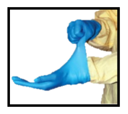
Gloves go over the cuff of the gown.

Take the 2<sup>nd</sup> glove with the bare hand and touch only the top edge of the cuff.