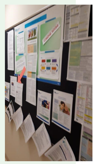
AUA QI board at Medicine Hat Homecare

Lewis Estates Retirement Residence uses the AUA Quality Improvement board and tracks their progress for all to see. This keeps the AUA project fresh and visible and creates excitement in the staff when they see the numbers declining! People say it affirms the work they are doing and recognizes their efforts. The memory care unit has reduced antipsychotic use to 17%.