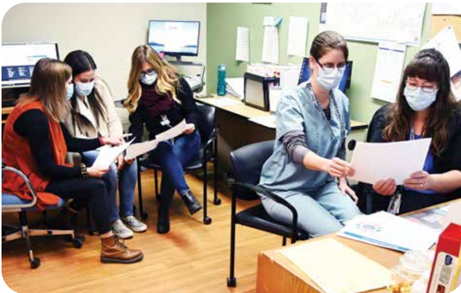
Super users at Leduc Community Hospital prepare for the Wave 2 launch of Connect Care. Super users receive extra training on the Connect Care system so they can provide support to their colleagues in the early days after a launch.

Connect Care is a major undertaking under normal circumstances and this is magnified during the pandemic. I am humbled and inspired by the collaboration, determination and confidence the Wave 2 sites and the other zone sites and