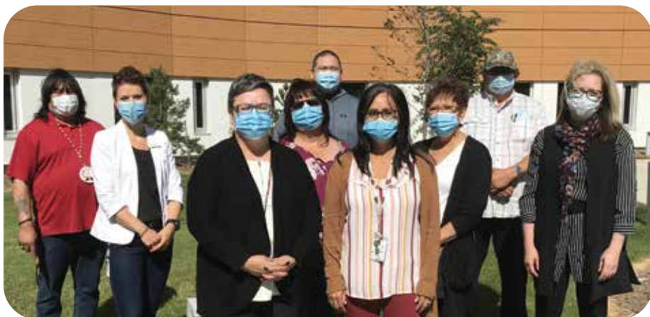
Members of the Grande Prairie Regional Hospital Indigenous Engagement Committee pose on the grounds after taking a tour of the new hospital last year.

mutual acceptance and helps patients and families feel welcome when seeking care. The Indigenous Engagement Committee includes Indigenous representatives from throughout the region — as well as the High Prairie, Peace River and Grande Cache areas — to bring together different perspectives and ideas on how best to honour Indigenous culture and history.