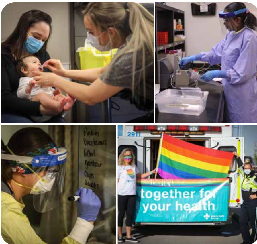
AHS is made up of faces and places—people with a passion for healthcare who work in five zones across the province.