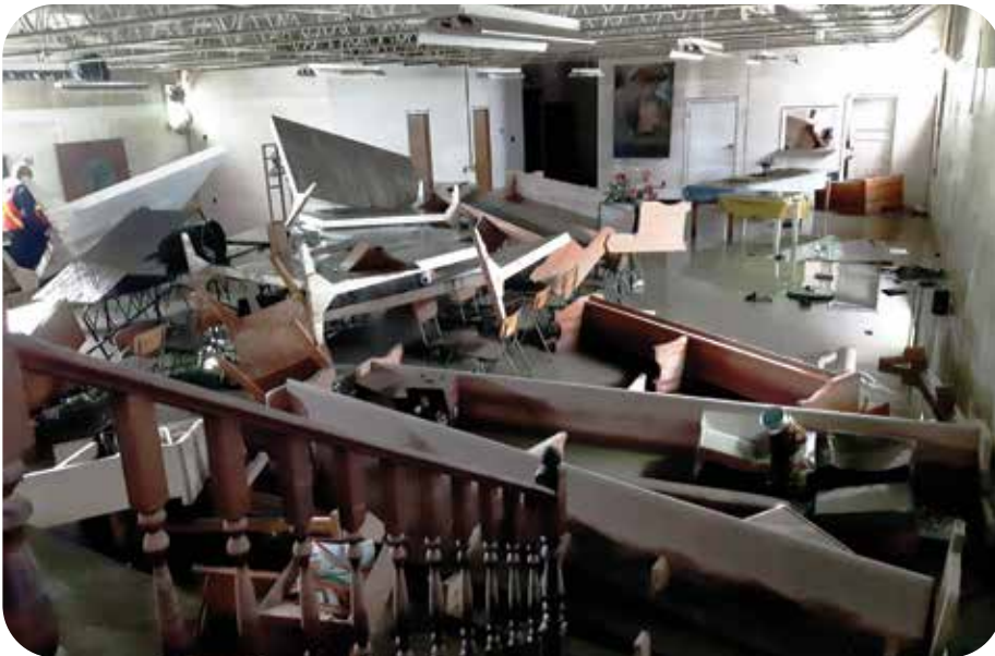
Krista Park, an AHS Peace River Public Health Inspector, captured this photo while on deployment to Fort Vermilion in response to spring flooding.