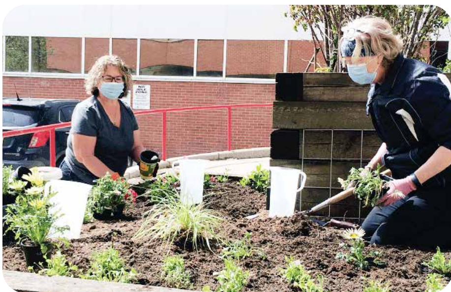
Two members of the “Labenders” team plant annuals in a flowerbed at the QEII Hospital.