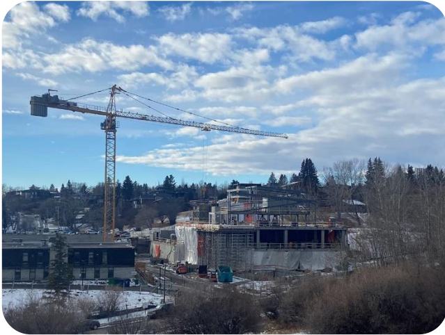
The concrete for the main, second, third and penthouse floors have been poured