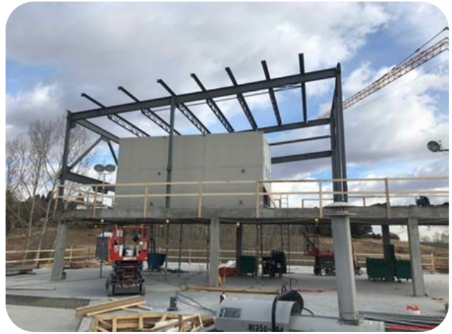
Mechanical penthouse steel joists installed and air handling unit in place