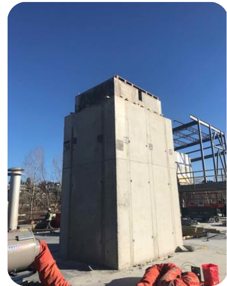
Elevator core poured