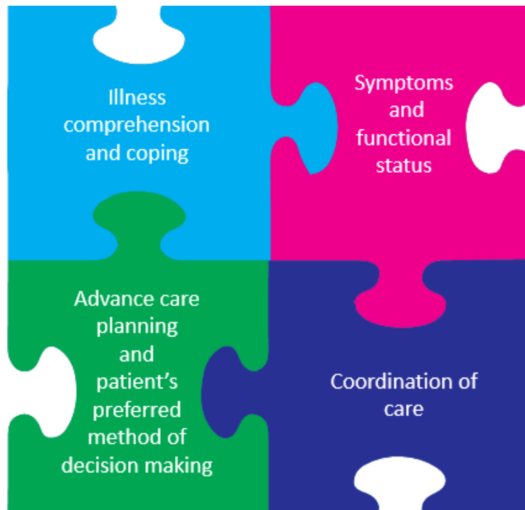
Figure 2. Four essential components of an early palliative approach to care.

Several recent analyses of trials integrating oncology and palliative care point towards specific key elements of an early palliative care approach that support whole person care, quality-of-life focus, and mortality acknowledgement. 6,13,21,32 In Alberta, these have been synthesized into four components, as shown in Figure 2 .