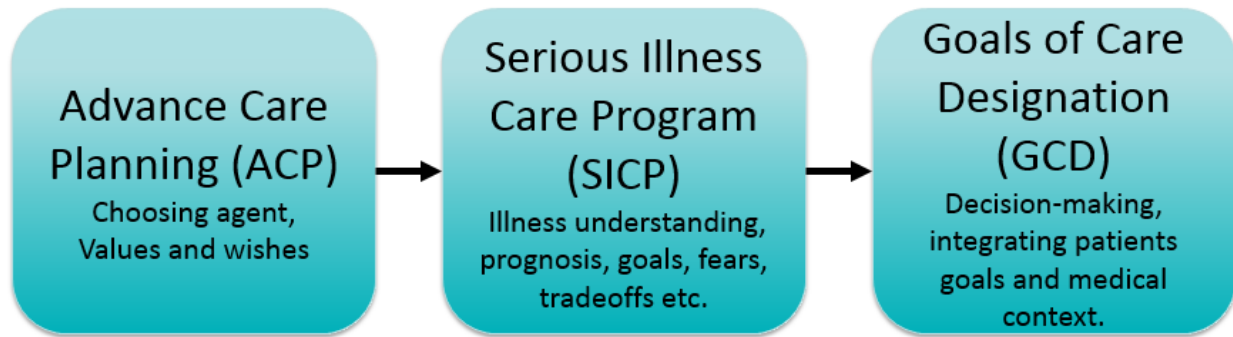
Figure 3. Conceptual model of where SICP fits within AHS’s model of ACP and GCD determination.