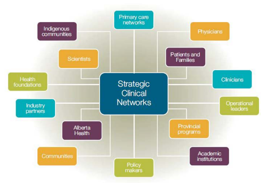
Figure 1 Network stakeholders

Alberta Health Services (AHS) launched its first clinical networks in 2012, with an emphasis on patient engagement and rigorous adherence to implementation science and evidence-based practice. There are currently 16 Strategic Clinical Networks (SCNs), each focusing on a specific area of health (Figure 2) and partnering with stakeholders across the health spectrum.