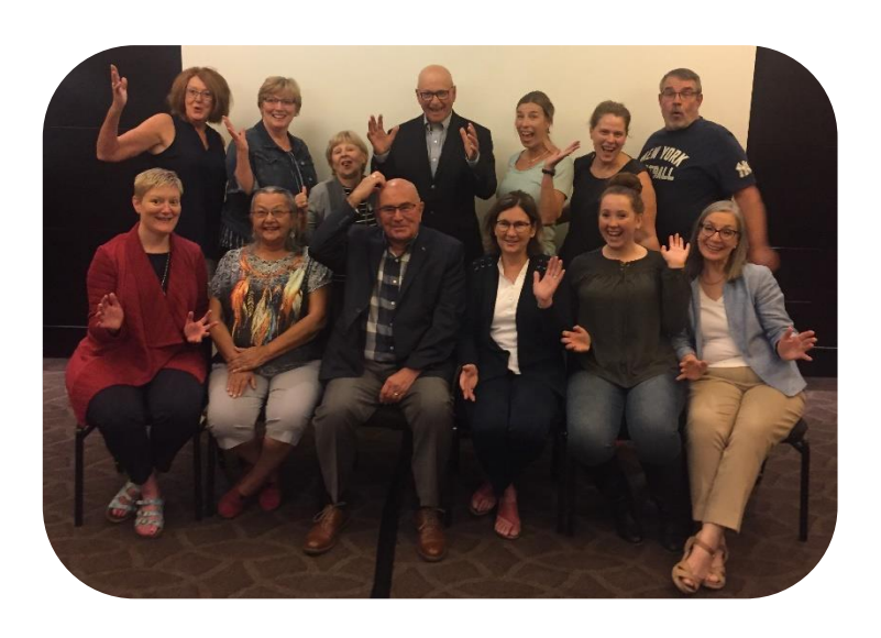
Anyone interested in applying to the AHS Seniors & Continuing Care Provincial Advisory Council can do so through the AHS website.

In 2020 we will endeavour to grow virtual meeting skills and work to develop new and varied ways to connect, build and expand relationships.